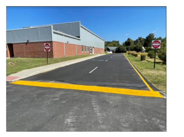
School Board Office (SBO) Enhancements