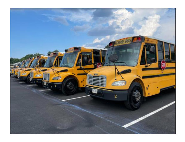
New arrival/dismissal process at CBES